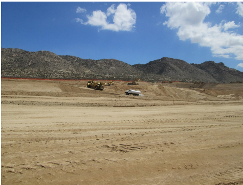
Photo 6: Construction activities associated with rough grading of the 500 kV substation pad at the ECO substation site continued during this reporting period.