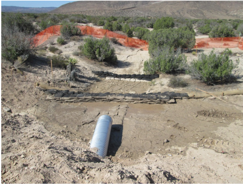
Photo 3: BMP's were observed being repaired following a storm event that occurred on August 29, 2013 in accordance with the SWPPP and MM-HYD-1.