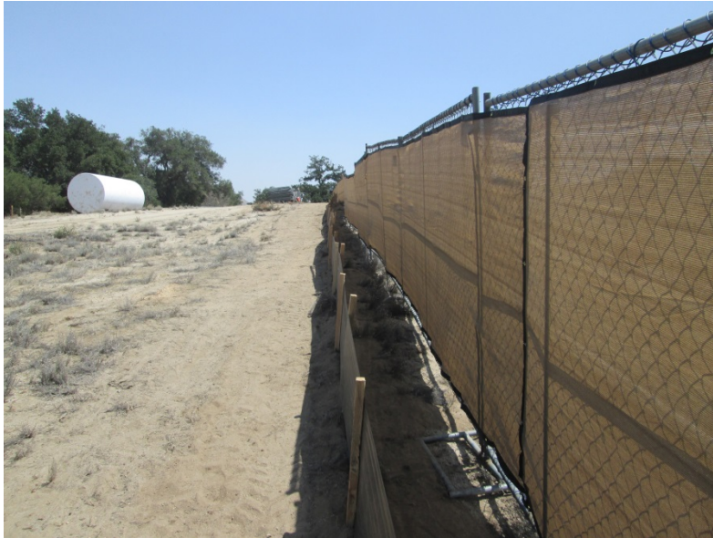
Photo 1: A temporary chain-link fence and silt fence have been installed along the perimeter of the Boulevard Rebuild Site. In accordance with MM-VIS-3A the Boulevard Substation Rebuild Site is visually screened with opaque fencing materials.