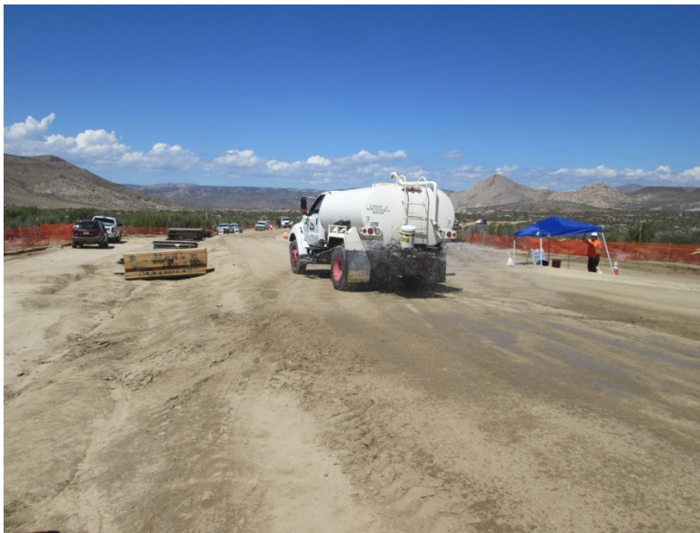
Photo 4: Water trucks were observed being utilized on a regular basis for dust control purposes in accordance with MM-BIO-4a and the Dust Control Plan.