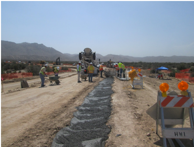
Photo 2: Construction crews place backfill material within the 138 kV underground duct bank along the Southern Access Road. All work activities along the Southern Access Road were observed to be completed within the approved work limits during this reporting period.