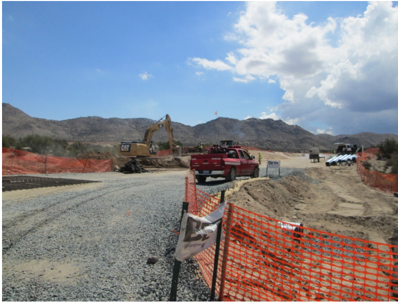
Photo 5: A Type-VI engine was utilized during this reporting period to complete routine fire patrols in accordance with the Construction Fire Prevention/Protection Plan (MM-FF-1).